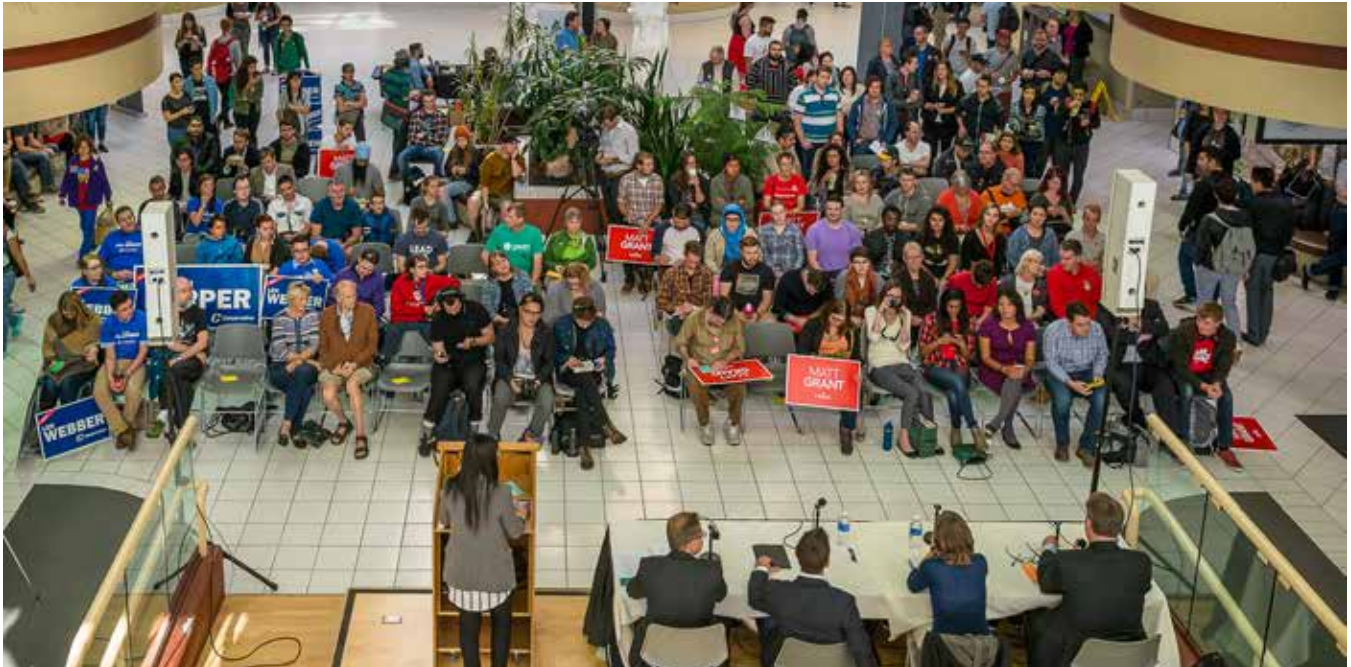
Students attend a federal election forum in MacHall

representation due to significant misunderstandings about the role of stakeholder representation in decision-making and good governance processes. The SU's VP Academic and the university's Provost met with student members of Faculty Councils in February to better understand the challenges facing student members and determine how the faculties, central administration, and the SU can support students to be effective participants in Faculty Council meetings. There is significant variation in how Faculty Councils select student members. Faculty Councils have committed to publishing meeting schedules, agendas, and open minutes online for students to access.