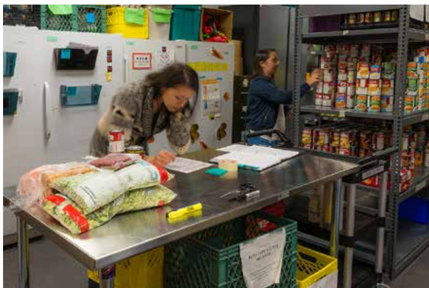
Volunteers at the SU Campus Food Bank

The SU Information Centre/Campus Lost & Found is operated year-round by student coordinators and volunteers to provide accurate and timely information to the campus community and visitors to MacHall. It is also the central lost and found depot for the entire campus. Open on weekdays from 10:00 a.m. to 4:00 p.m. during the fall and winter semesters, The Information Centre/Lost & Found provides visitors with directions and information about campus resources and events. It also stores lost items, returning them to their owners. Between September 2015 and April 2016, the four