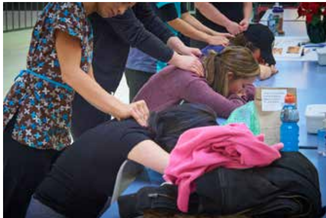
Stress Less Week

This year, the SU celebrated the 55th annual Bermuda Shorts Day on April 13 in lot 32. The SU distributed 8,480 wristbands to students in advance of the event. 7,928