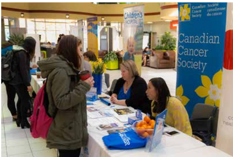
U-Help Volunteer Fair

Cinemanía is one of the SU's longest-running, free programs, attracting students on Monday nights to watch popular movies from theaters before they are released to DVD. There was a