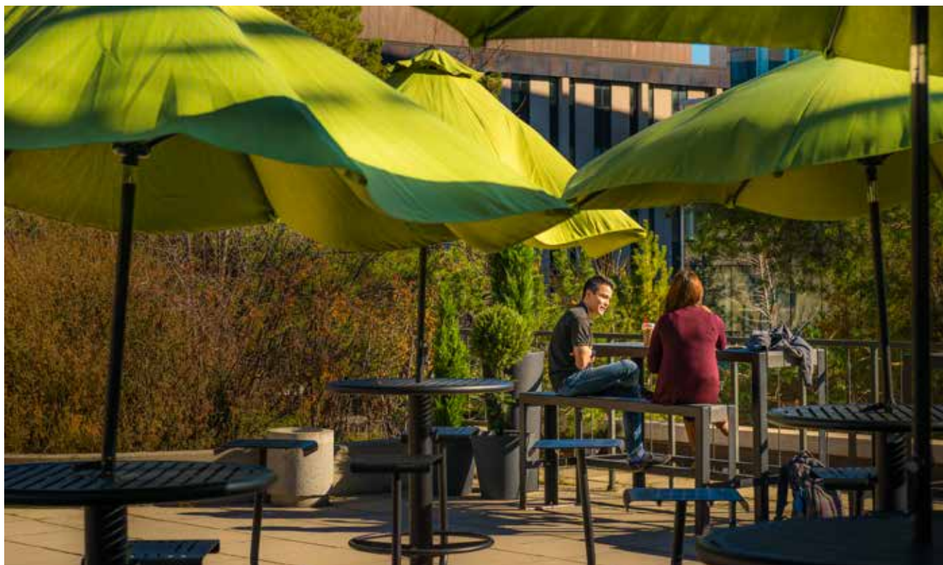
MacHall Patio Furnishings supported by SU Quality Money

who make a lasting impact on students. Most importantly, students determine the nominees and winners. Almost 500 students submitted nominations this year, and on April 20, 2016 the SU honoured 34 faculty members and instructors for their commitment to student success at its annual Teaching Excellence Awards ceremony. Award recipients receive an Apple Award and a framed certificate. In addition, the SU made a $5,000 donation in recognition of the winners to the university's Taylor Institute for Teaching and Learning. The full list of award winners is available on the SU website.