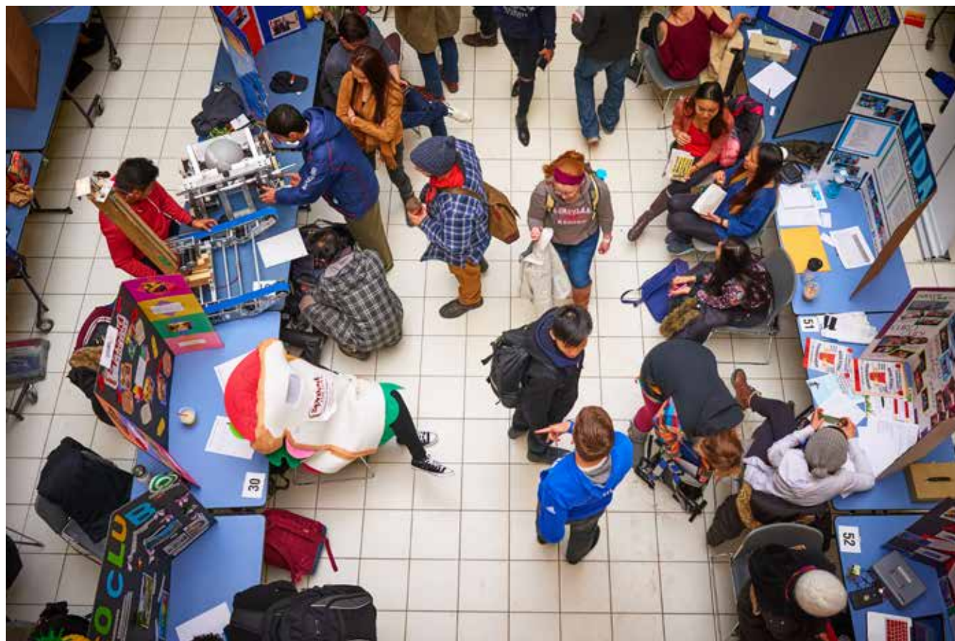
SU Clubs Week

During the Clubs Awards Banquet, held each April, the SU recognizes collective excellence in team leadership, service, sustainable practices, advocacy, and innovation. The $250 awards in various categories encourage the improvement