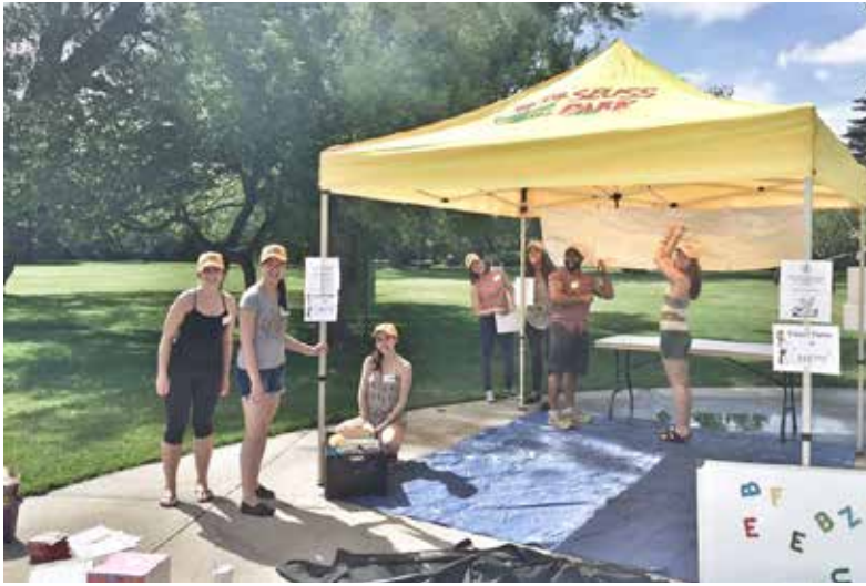
Volunteers prepare for Dr. Seuss in the Park

diverse group of civil society organizations and schools. While having a lot of fun, the students experienced international volunteerism in a way that left a positive impact on the local community.