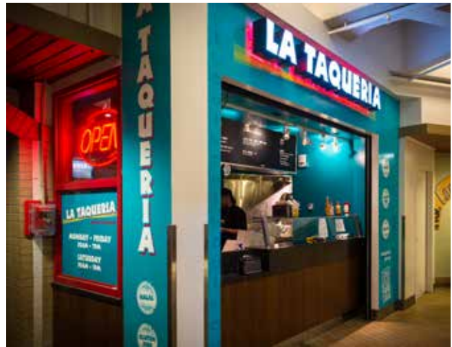
La Taqueria in MacHall

MCEC plays host to a multitude of different types of events including large conferences, tradeshow, meetings, holiday parties, weddings, television productions, and concerts.