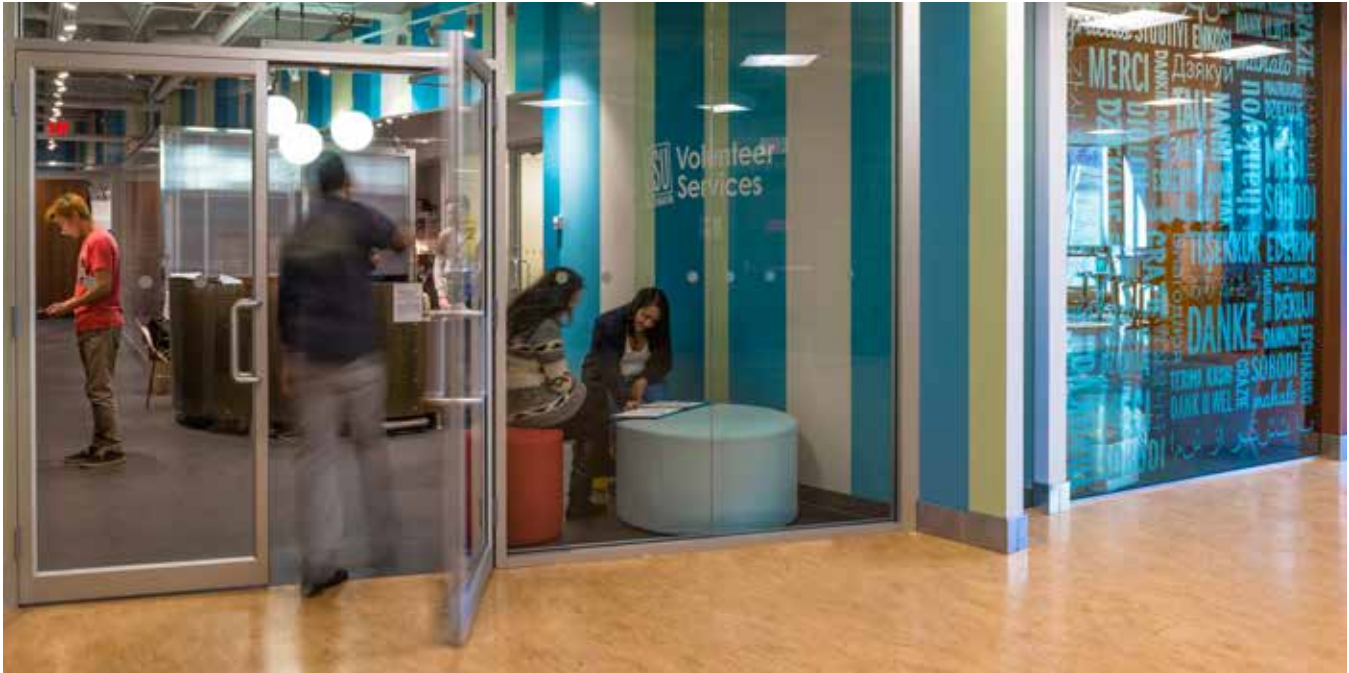
SU Volunteer Services renovation and expansion

The SU's facilities department is committed to the health and safety of students and campus community members within MacHall. The SU operates a building maintenance department and cleaning services in MacHall for the benefit of all users of the student centre, as well as managing and funding the operation of the MacHall loading dock for all MacHall tenants.