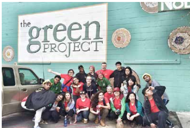
Volunteers after a day of work in New Orleans

The Administrative Volunteer Program (AVP) gives students the opportunity to gain professional administrative experience by coordinating the SUVS front desk. Through their work, the AVP volunteers gain practical, on-the-job training in a variety of areas - ranging from file management to event planning. In return, they provide a high quality of customer service to those who visit the office. The AVP